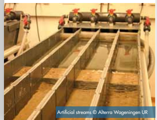
Artificial streams