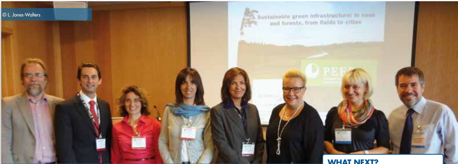
Keynote speakers at the green infrastructure session held at the ESOF 2012 conference, 15th July