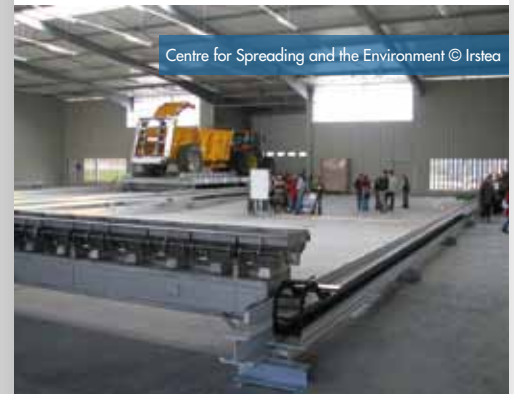
Centre for Spreading and the Environment

Other technical platforms are dedicated to both agro-environmental assessment of spraying technologies and irrigation equipment, and in particular their use in real operating and climate conditions. These activities aim to model the functioning of irrigation machines and systems and simulate their employment in farms and small regions.