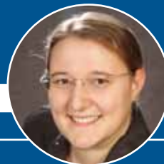
J. Hauck (UFZ)

Based on voluntary contributions of motivated researchers, PRESS responded quickly to a growing issue, delivering the same quality results as FP projects. It was worth it!