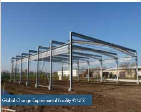
Global Change Experimental Facility

Education facilities are also available at PEER centres. For example, the Leur Laboratory for Water and Sediment Dynamics at Alterra, used by researchers for its straight and tilting flumes and the rainfall simulator, has at least three other important functionalities: it allows students to observe both friction and local energy losses, and presents a demonstration flume and orifice to show how these widely used systems work by applying the energy conservation law and the equation for continuity of mass.