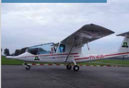
Environmental Research Aircraft

Other technical platforms are dedicated to both agro-environmental assessment of spraying technologies and irrigation equipment, and in particular their use in real operating and climate conditions. These activities aim to model the functioning of irrigation machines and systems and simulate their employment in farms and small regions.